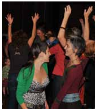
Midwives dance in anticipation of the live auction at the Conference Social.