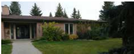
Lucina Birth and Family Wellness Centre in Edmonton, Alberta