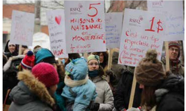
Montreal Rally February 24 th , 2013.