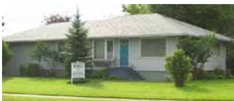
Arbour Birth Centre in Calgary, Alberta