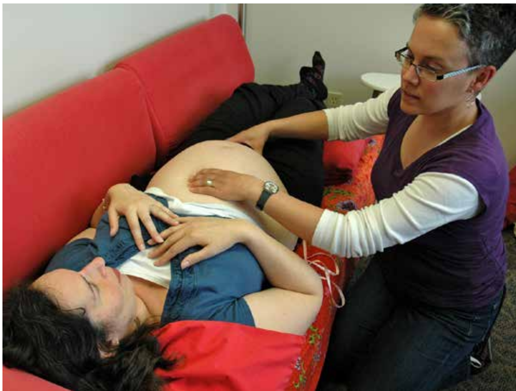
Midwifery clinic in Ottawa, ON