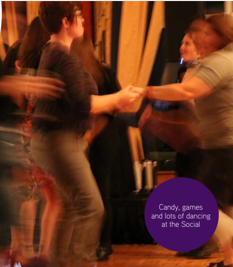
Candy, games and lots of dancing at the Social