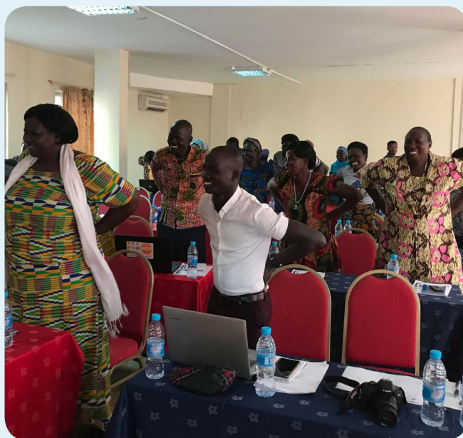
Group stretch at the RMC Workshop

Bev said that disrespectful care and abuse can be from midwives, traditional birth attendants, nurses, doctors and administrators, but the focus of the RMC workshop is teaching nurses and midwives, so they can influence their facility and everyone at it in a safe way. "They need to share what they learned but say it in ways that people don't get angry with them," she said, noting that they can't make these changes by themselves; they need to go back to their communities and get their feedback and participation.