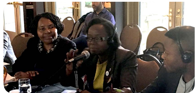
Commenting at the South-South Meeting