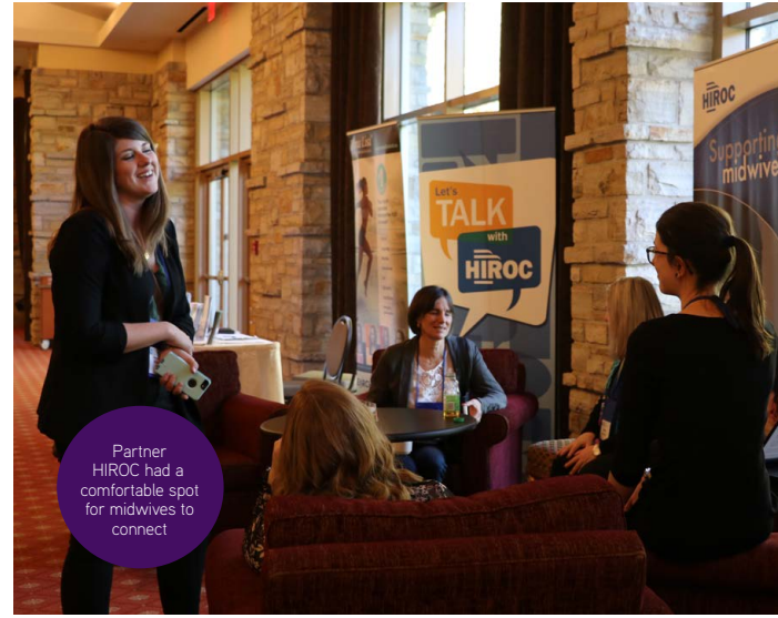
Partner HIROC had a comfortable spot for midwives to connect