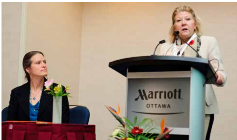
Conservative MP from Ontario, Lois Brown, addresses participants during opening night of the CAM conference.