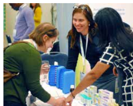
A delegate visits one of the many exhibitor booths.