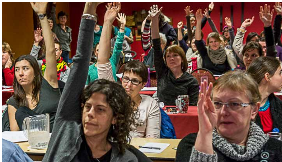
An exceptionally high turnout of midwives for the vote on the new agreement.