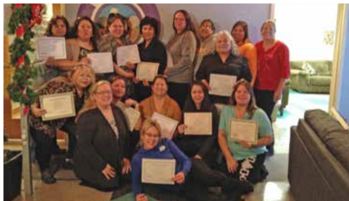
Instructors and midwives at Six Nations with the graduates of the doula training workshop.

A reception to celebrate the launch of the Aboriginal Midwifery Toolkit was held on November 9 th . The Toolkit includes jurisdiction specific sections on bringing birth back to communities and also includes video documentation that speaks to the impact midwifery can have on improved health outcomes and on building stronger community ties, connection to the land and place and space for self-determination. NACM would like to thank the MABC, the AOM, FNIHB and CAM whose sponsorship of this event will allow NACM to continue sharing this resource. To view the online version of the Toolkit, please consult: http://aboriginalmidwives.ca/toolkit