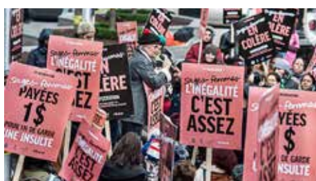
Quebec midwives and supporters were mobilized and determined throughout the two and a half years of negotiation.

Though this agreement marks improvement on many fronts, it is nevertheless just one step in a continuing struggle for just and equitable working conditions for Quebec midwives. After two and half years of negotiation and unprecedented mobilization of popular support, the midwives of Quebec are satisfied with the work accomplished so far and are thankful for the wonderful support of the women, families and midwifery community of Quebec.