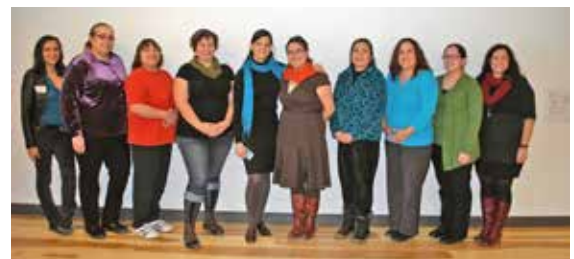
Midwives from Seventh Generation Midwives Toronto celebrate with midwives and staff from the Six Nations birth centre.

NACM and CAM wish to congratulate the midwives of Toronto and Ottawa on the opening of their new birth centres! The Ottawa Birth and Wellness Centre and the Toronto Birth Centre are wonderful new options for place of birth for families in Ontario. The Toronto Birth Centre becomes the second midwife and indigenous led birth centre in Ontario, after the longstanding birth centre at Six Nations. Thank you to all of the midwives who have worked so hard to make this happen... what a beautiful vision you have birthed!