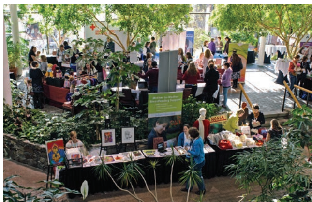
The exhibit hall in the atrium of the hotel.