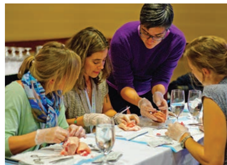
Midwives and students participate in a hands-on suturing pre-conference workshop.